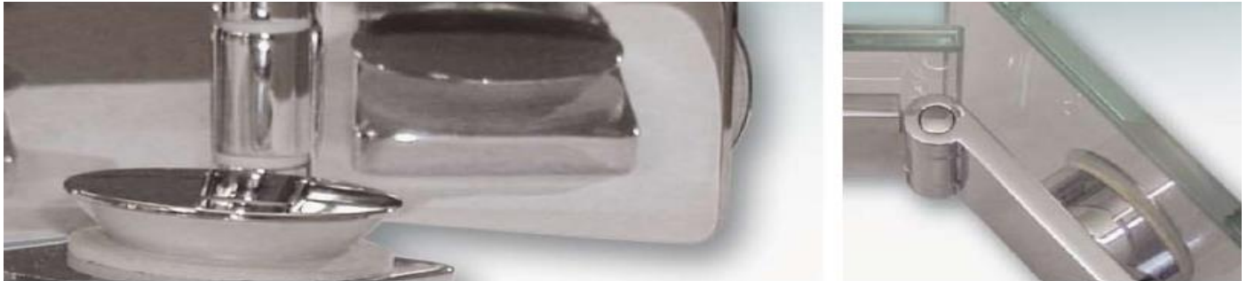
Hinge glass/glass 180° overlapping, hinge band flush (screw system)